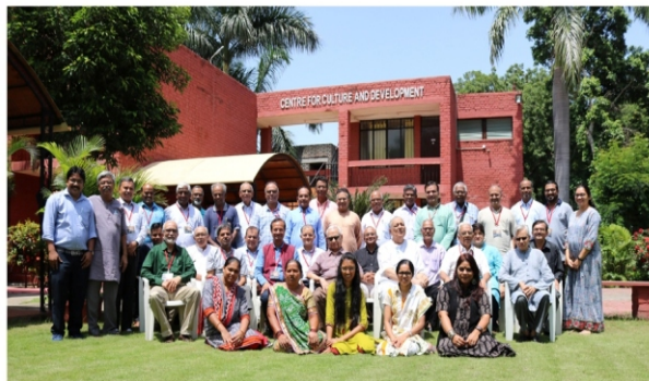
National Seminar on Procedural and Substantive Democracy in India On September 7, 2018 at CCD