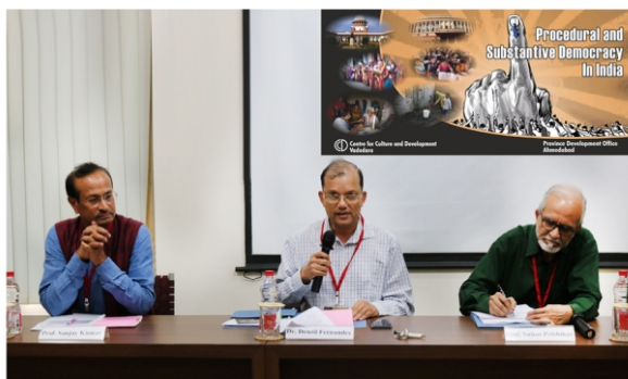
National Seminar on Procedural and Substantive Democracy in India On September 7, 2018 at CCD